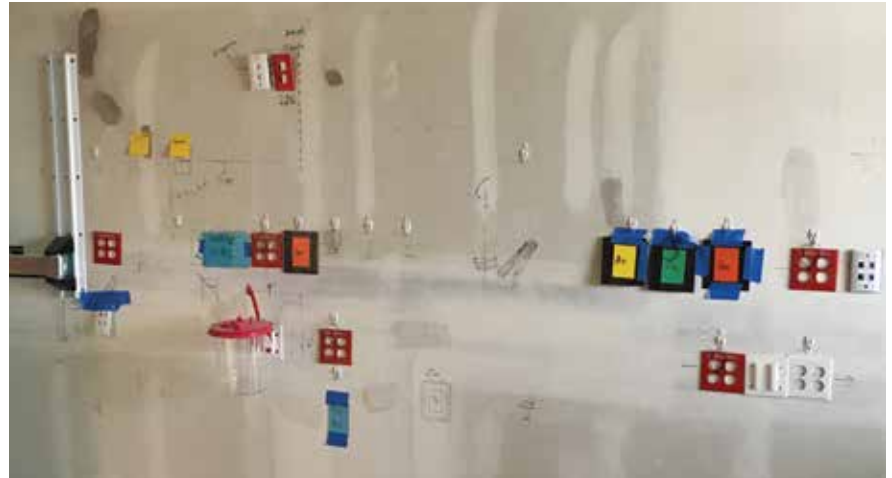
The location of electrical outlets and other equipment will be moved in the final design as a result of the simulations performed in the “mock patient rooms.”