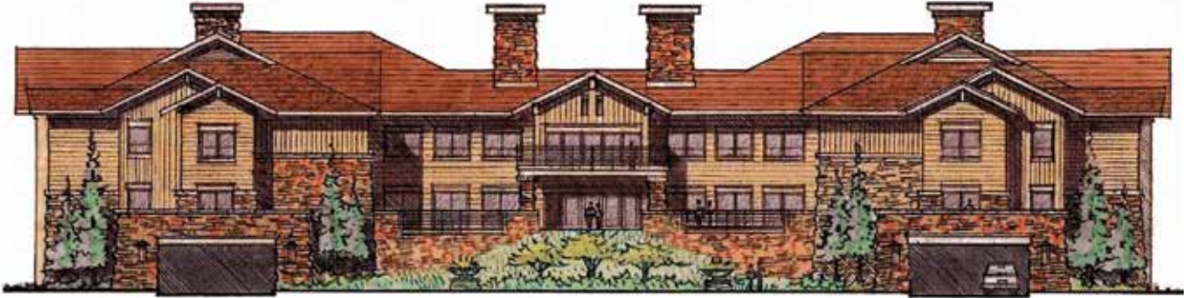
Artist's rendition of The Legacy

We can't wait to open our state-of-the-art residential home and rehabilitation center for seniors! It's going to be beautiful with balconies, patios and courtyards near the Lasting Legacy Park on south Highway 59. We'll have a large Towne Center for gatherings and social events. All resident rooms will have in-room oxygen, thanks to a grant from the Wyoming State Lands Investment Board, and some rooms have built-in resident lifts. What's great is that the new facility can serve seniors with a wide range of programs—transitional care for short rehab stays with a large rehab and therapy area, regular residential care, a planned memory care unit, and adult day services. Watch for our grand opening celebration in early summer 2016! Visit the Campbell County Health Facebook page for regular updates.