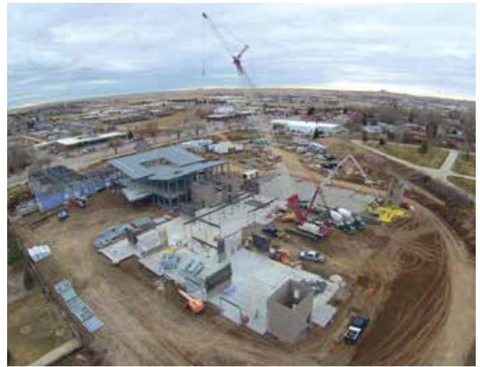
Aerial photograph of The Legacy Living and Rehabilitation Center.

We can't wait to open our state-of-the-art residential home and rehabilitation center for seniors! It's going to be beautiful with balconies, patios and courtyards near the Lasting Legacy Park on south Highway 59. We'll have a large Towne Center for gatherings and social events. All resident rooms will have in-room oxygen, thanks to a grant from the Wyoming State Lands Investment Board, and some rooms have built-in resident lifts. What's great is that the new facility can serve seniors with a wide range of programs—transitional care for short rehab stays with a large rehab and therapy area, regular residential care, a planned memory care unit, and adult day services. Watch for our grand opening celebration in early summer 2016! Visit the Campbell County Health Facebook page for regular updates.