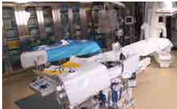
The cardiac cath lab at CCH is equipped with the latest, most advanced technologies.