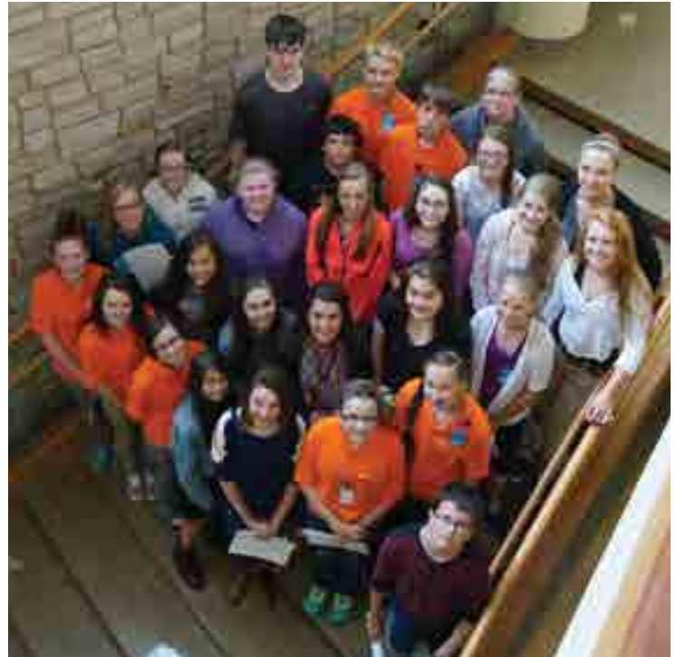
This year’s team of junior volunteers are ready to take action after completing orientation.