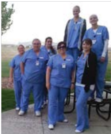
Nursing students gather before the start of classes.

CCH has covered the cost of a full-time educator and half the cost of a nursing program director for the past several years.